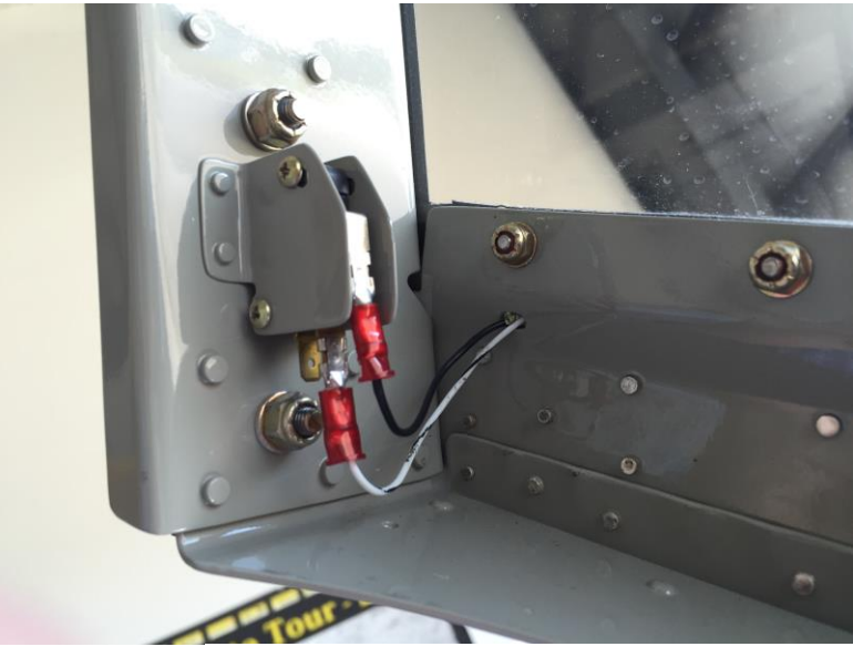
FIGURE 3: CANOPY SWITCH