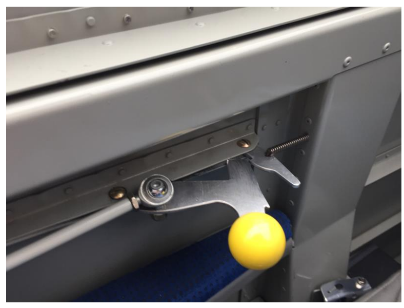
FIGURE 2: CANOPY LATCH PRE ENGAGEMENT OF CANOPY SWITCH

The following pertains to RV-14 canopy latch systems. As mentioned above, the in flight the canopy switch may become disengaged and cause a false canopy warning. Final canopy switch adjustment to prevent disengagement of the canopy switch in flight may result in the canopy latch handle not being fully closed when the canopy switch engages (see Figure 1 below). This should be noted in any checklists.