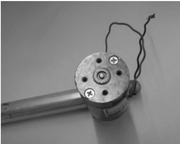
The motor unit and screws securing the housing to the gearbox.

Find a 12-v battery and test the motor by holding the wires against the posts. Reversing the wires should make the motor run the other direction.