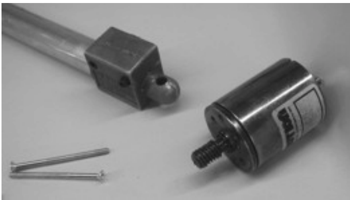
The long phillips-head and short allen-head screws have been removed or backed off and the motor separated from the gear box.